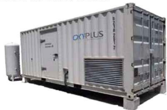
In container equipped with power cabinet, ventilation and lighting