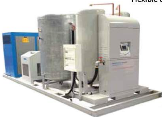
Skid- mounting with power cabinet

Flexible design available for indoor and outdoor locations