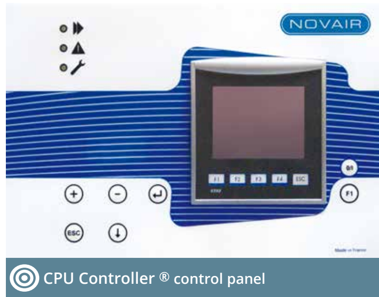
CPU Controller ® control panel